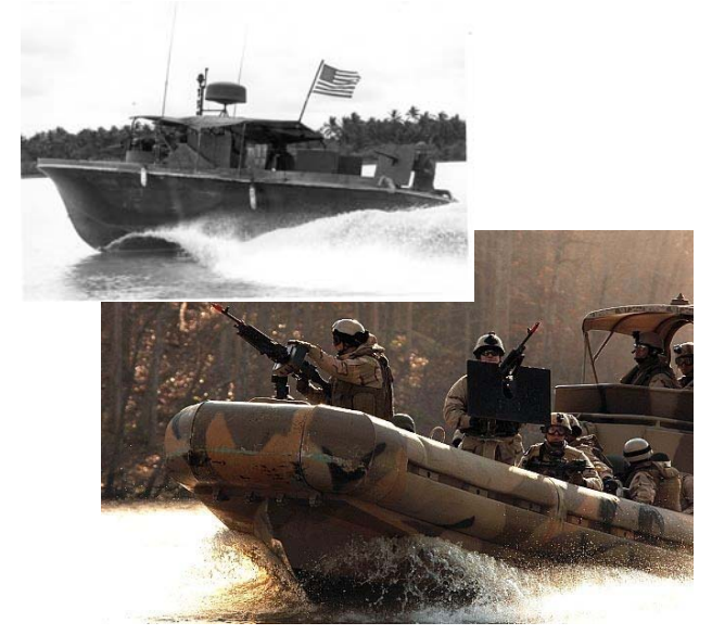
Riverine Warfare in Vietnam and Iraq