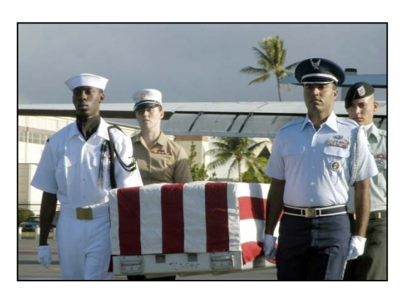
JPAC Search for MIAs